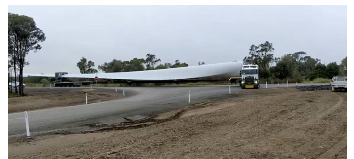
Transportation of 75 m wind turbine blades from Brisbane to Dulacca Wind Farm.